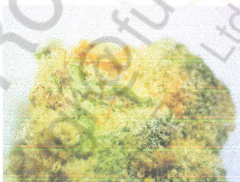
Image 3 - Identity A - Macroscopic Identification

Test results relate only to the items tested as received. This Document shall not be reproduced without the written approval of Vinlab (Pty) Ltd. Opinions and interpretations expressed herein are outside the scope of SANAS accreditation.