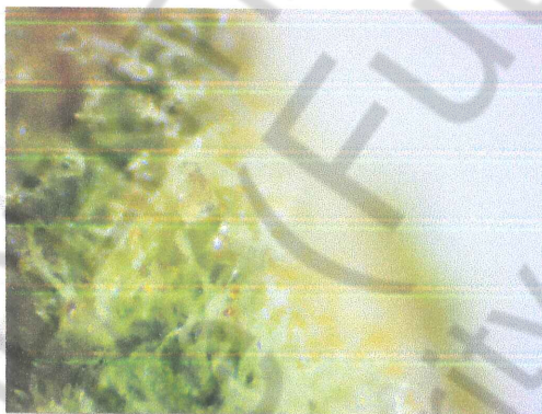
Image 5 - Identity B - Microscopic Identification

Test results relate only to the items tested as received. This Document shall not be reproduced without the written approval of Vinlab (Pty) Ltd. Opinions and interpretations expressed herein are outside the scope of SANAS accreditation.