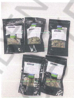
Image 2 - Sample in packaging as received from client